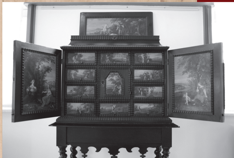
Cabinet Walnut, ebony, copper, tin 17 th century, Flanders